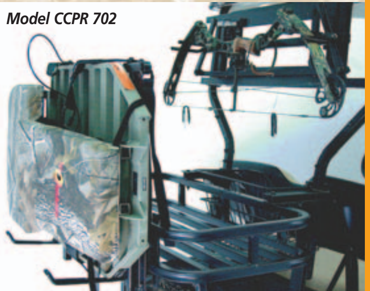
Model CCPR 702