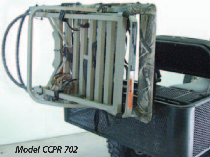
Model CCPR 702